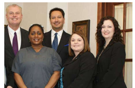
This is THE award-winning team that will take exceptional care of you!